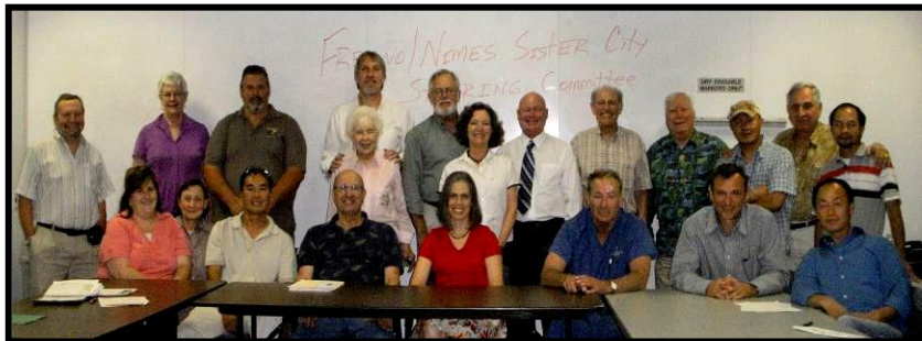
Fresno/Nimes Sister City Steering Committee

STEP 5: A concerted effort is underway by the Fresno/Nimes steering committee to collect letters of community support that will encourage Mayor Ashley Swearengin to contact the Mayor of Nimes and officially begin the twinning process.