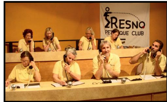
Thank you for calling KVPT