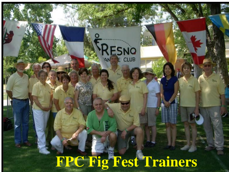
FPC Fig Fest Trainers

The 6 th annual Fig Festival was a celebration of the noble and mythological fig. This Fest is a unique event in Fresno, and the United States. In fact, it is the only Fig Festival in the U. S.