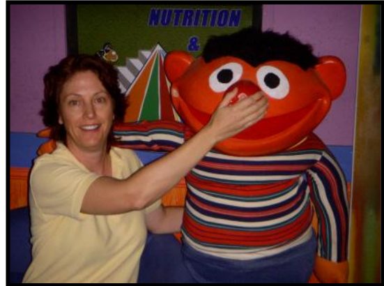
Ernie decides he likes Karen

PBS and local stations rely on contributions from people like you as their largest single source of financial support . Your support assures that Fresno—and all Americans—continue to benefit from award-winning programs that open up the worlds of current events, art, science, music, history, your local community, and more for everyone from all walks of life. Diversity is a key word at PBS.