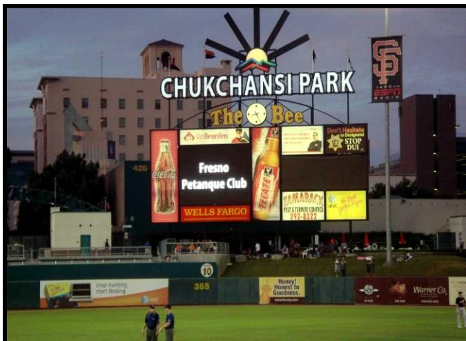
FPC ~ On The Marquee!

Twenty-eight (28) members of FPC recently turned out to support Grizzlies Baseball at Chukchansi Stadium in downtown Fresno at the second annual "Baseball and Boules" outing.