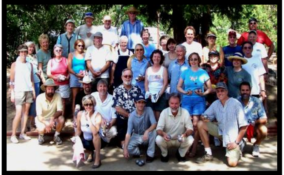
Oakhurst and Fresno Petanque Club Members

Future joint club meet ups are already being discussed and Oakhurst is planning another road trip to boule with us one upcoming Tuesday evening.