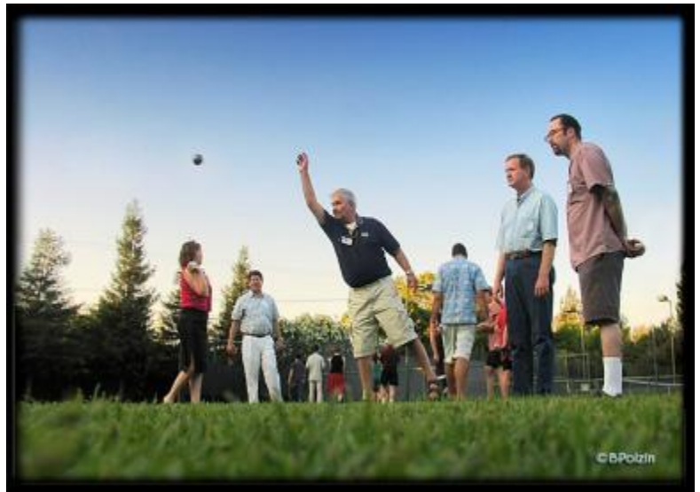
Bastille Day Celebration Boulers

This Sunday event was held at the Fig Garden Swim and Racquet Club. It was a beautiful day to celebrate the greatness of the grand republic of France.