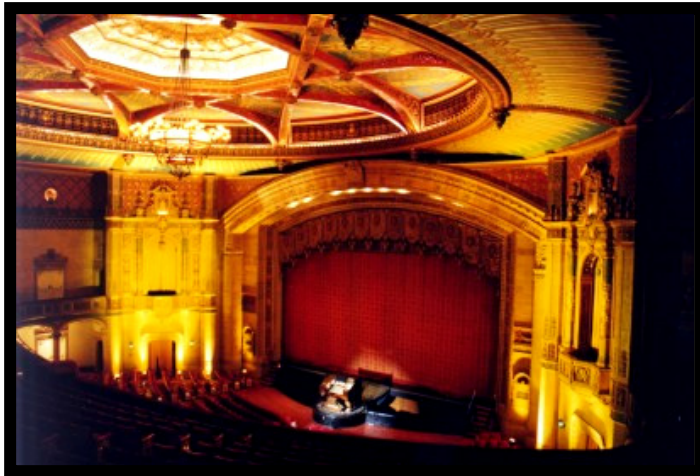
INTERIOR OF WARNOR THEATER

Great architecture defines a community. It is the magic of a city. Buildings are places that people live, work, love, play and enjoy life. Fresno is fortunate that it still has great buildings in its downtown area. These architectural gems are sleeping beauties waiting to be reawakened.