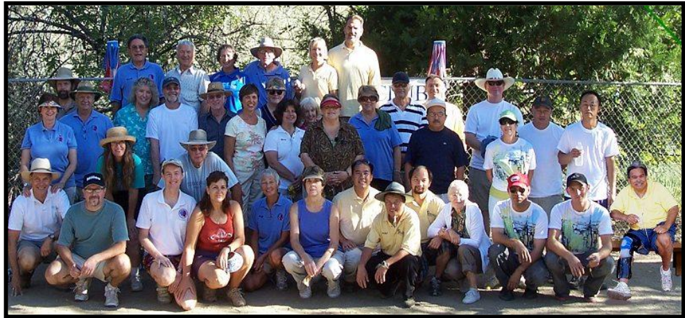
FPUSA Southwest Regional Triplette Players