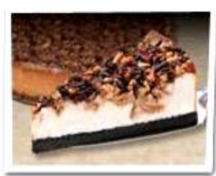
Let’s Eat Cake